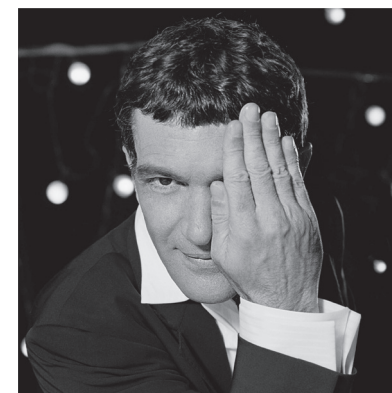
To see or not to see

Throughout these years many have become involved with the work of Eyes of the world in the fight against preventable blindness such as government representatives (the Head of Government of the Principality of Andorra, Ministers of Health of the Government of Spain, Heads of regional Governments, mayors and councilors), personalities with international projection (Antoni Tàpies, Miquel Barceló, Andreu Alfaro, Jaume Plensa, Antonio Banderas, Ferran Adrià, the Roca brothers, Mariem Hassan, Lang Lang, Barbara Hendricks, Jordi Savall, Eduardo Galeano and Eduardo Mendoza, among others) and CEOs of major foundations and private companies (Gulbenkian Foundation, Champalimaud Foundation, FC Barcelona, Repsol, Inditex, La Caixa, El Corte Ingles, etc.).