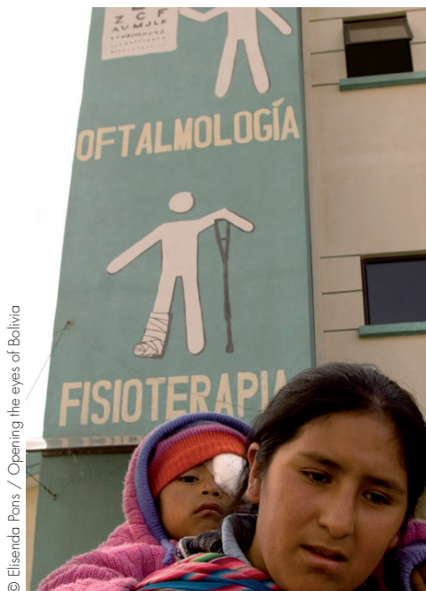
© Elisenda Pons / Opening the eyes of Bolivia