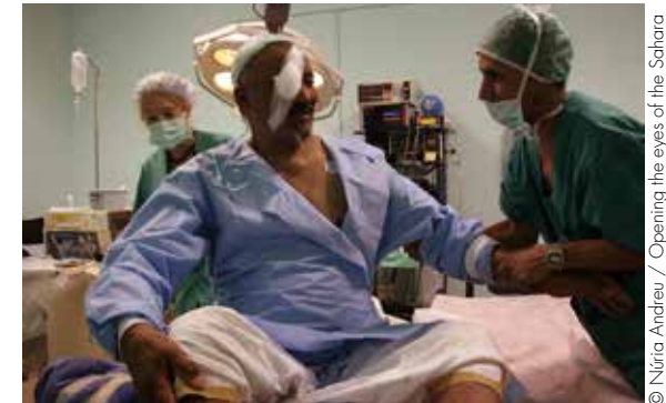
Opening the eyes of the Sahara

Eyes of the world periodically holds surgical commissions formed by expert ophthalmologists, anesthesiologists, surgical technicians and optometrists. They visit people with visual deficiencies and operate on patients with ocular pathologies. Since 2001, the Foundation has made 552,835 visits and 26,460 interventions.